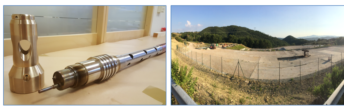
Figure 3 – HT-HP logging tool