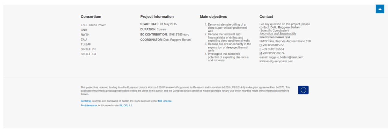
Figure 2: Project structure page