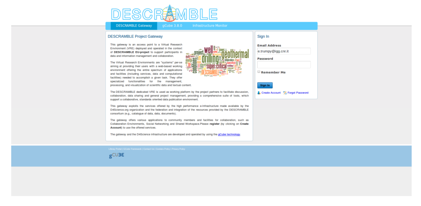
Figure 3: DESCRAMBLE private part served as VRE access