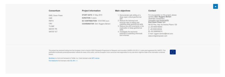
Figure 1: Home page